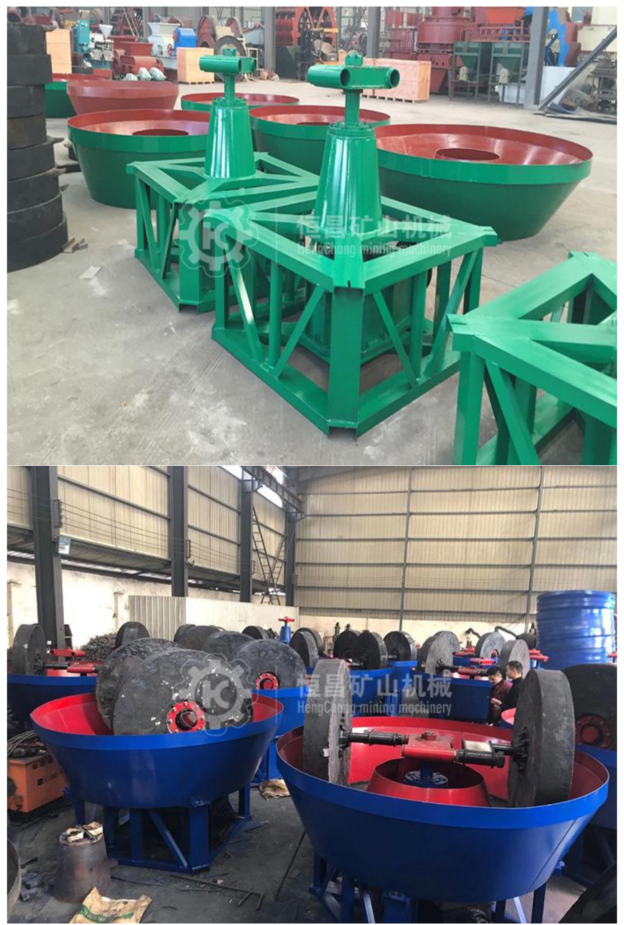
Jiangxi Hengchang Mining Machinery Manufacturing Co., Ltd Website: <a href="https://www.hengchangmachinery.com/">https://www.hengchangmachinery.com/</a>

Contact: Hengchang Mining Machinery Whatsapp: +8618870705821 Email: <a href="mailto:info@miningmachinery.com.cn">info@miningmachinery.com.cn</a> Address: No. 3 Chuangye Road, Guzhang Industrial Park, Shicheng County, Ganzhou City, Jiangxi Province, China.