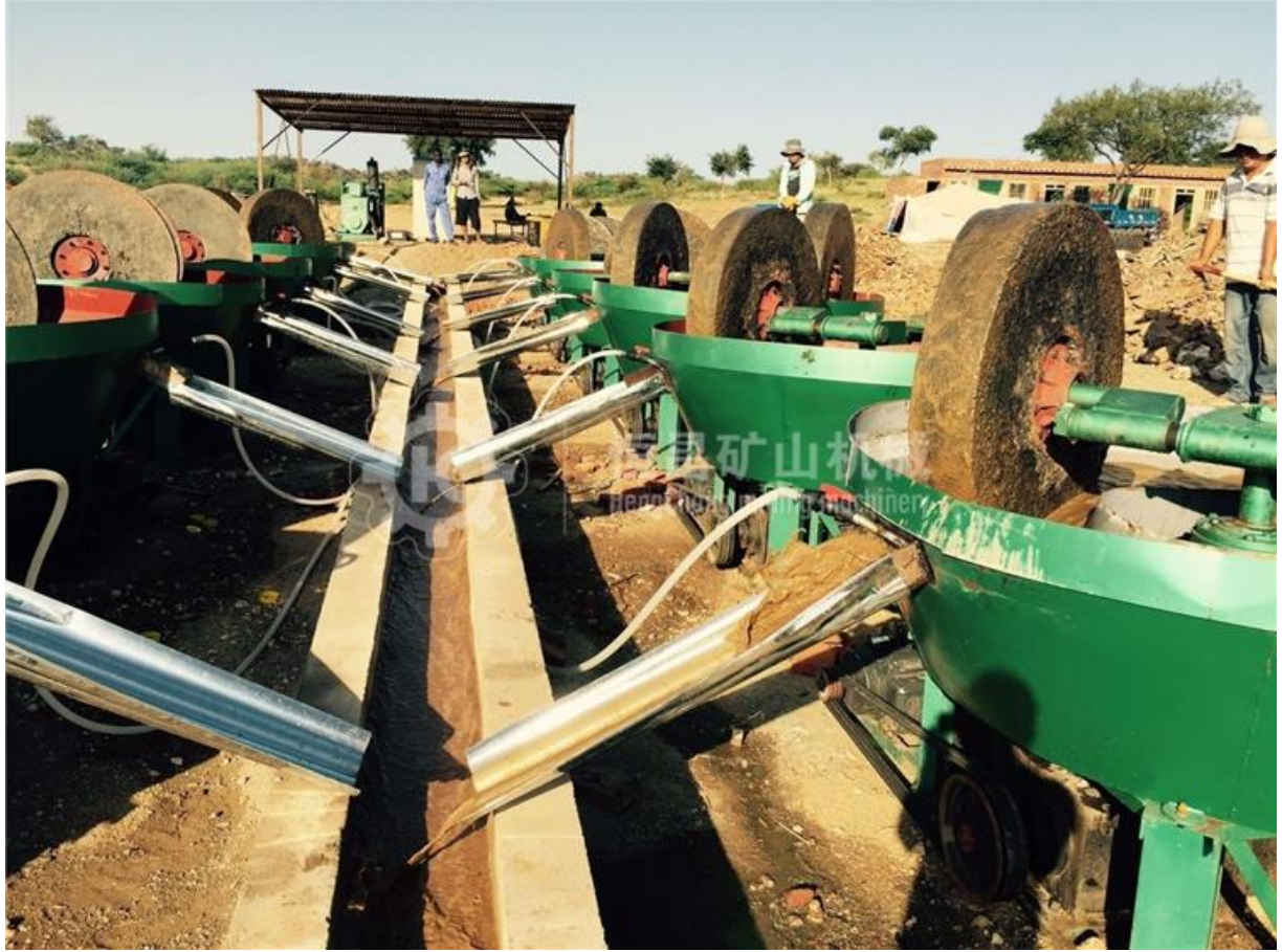
Jiangxi Hengchang Mining Machinery Manufacturing Co., Ltd Website: <a href="https://www.hengchangmachinery.com/">https://www.hengchangmachinery.com/</a>

Contact: Hengchang Mining Machinery Whatsapp: +8618870705821 Email: <a href="mailto:info@miningmachinery.com.cn">info@miningmachinery.com.cn</a> Address: No. 3 Chuangye Road, Guzhang Industrial Park, Shicheng County, Ganzhou City, Jiangxi Province, China.